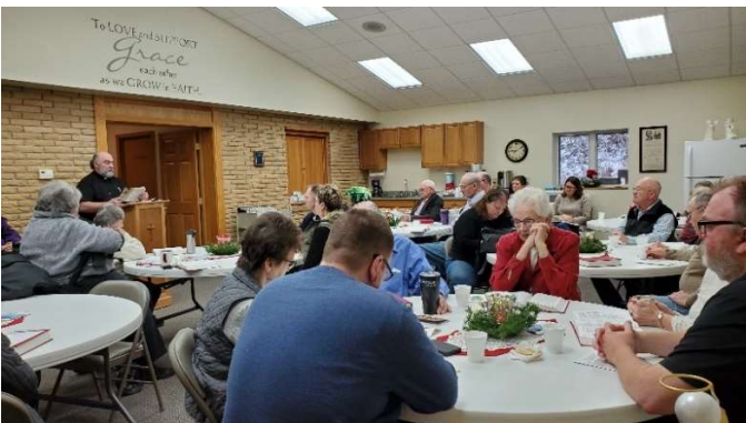
Cookies & Carols Worship on Sunday Dec 26