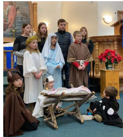
Sunday School & Confirmation Students Dec 19, 2021