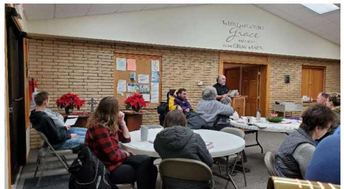
Worship held in the Fellowship Hall Dec 26