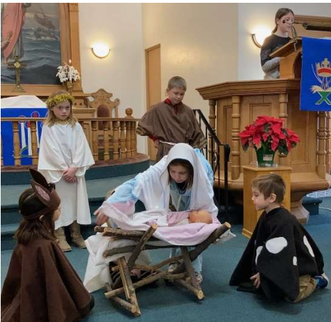
Sunday School Christmas Program Sunday Dec 19, 2021