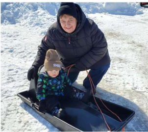
Sledding Party Feb 26 Food, Fun and Bingo.