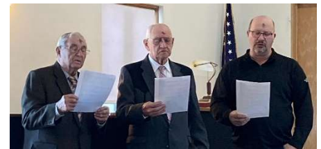
Grace Men's Group - Feb 26 following the Imposition of Ashes