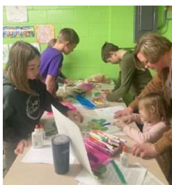
Grace Lutheran Sunday School children - March 2023