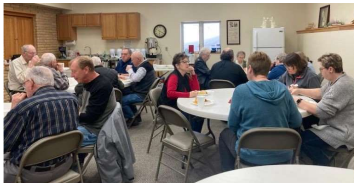
Lenten Suppers March 2023