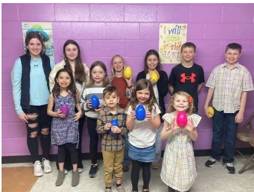
Sunday School Easter 2023