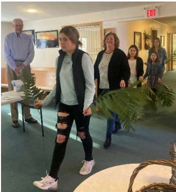
Palm Sunday April 2023