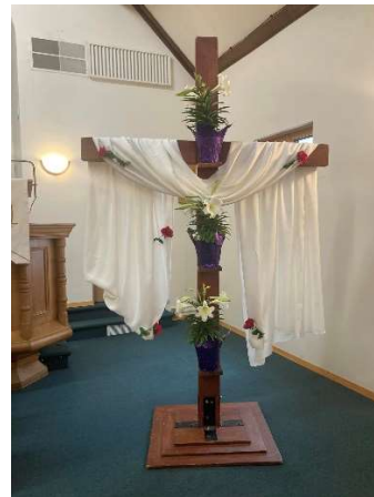
Easter Sunday April 2023