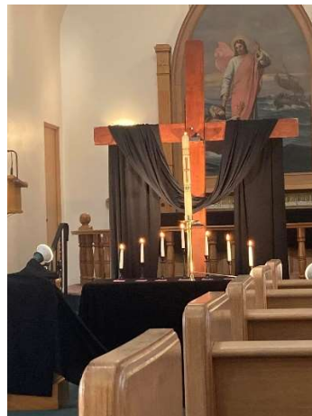
Good Friday April 2023