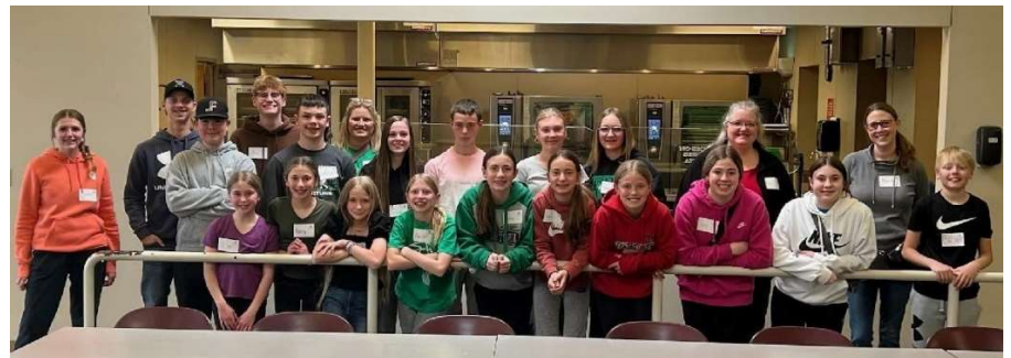
Youth Serving at The Banquet in Sioux Falls - April 2023