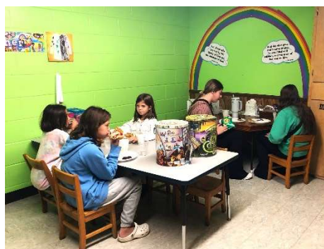
Sunday School Classroom