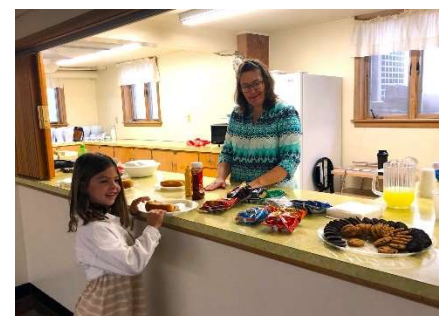
Enjoying a snack!