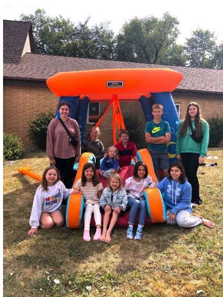
Sunday School students & helpers