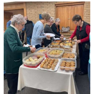
Brunch & Bingo Oct 2023