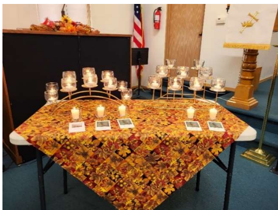
All Saints Sunday Nov 3, 2023