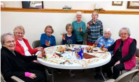
GLCW Meeting October 2023