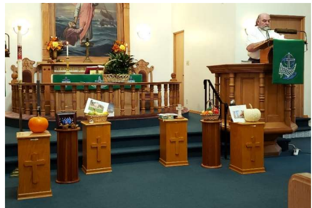
Ecumenical Thanksgiving Worship Nov 19, 2023