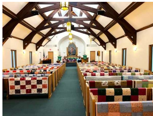
GLCW Quilts October 2023